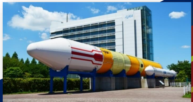
The "Rocket Square" at the entrance of the Tsukuba Space Center